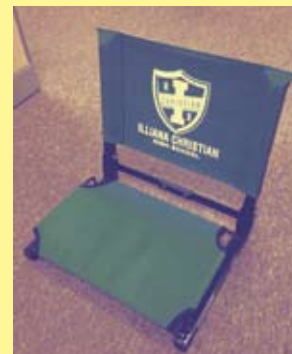
STADIUM SEATS are a special limited-time Spirit Wear addition.

Did you know that SPIRIT WEAR is now a fundraiser for the Sport Boosters? We have all new designs and clothing items as of early spring 2013. Most items are on display in the trophy cabinets in the gym lobby and in the trophy case outside the school office. Stop by and check them out or look for our Cash & Carry tables at various home games and all Open Houses. A special limited-time addition to Spirit Wear is our Stadium Seats. A sample is on display outside of the school office. Order forms are available in the office. Why not pick up something for a Christmas gift for your favorite student, parent or grandparent?